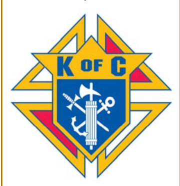
In Service to One. In Service to All

Knights of Co1umbus 180 S. Russell Ave Aurora, IL 60506